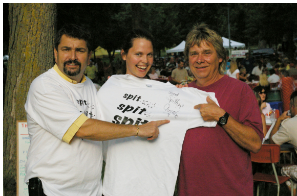
Who ARE these people at the watermelon seed spitting contest?!