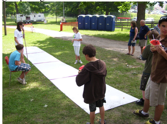
The spitting lane for the BIA watermelon seed spitting contest.

Anyone aiming to beat Wes Manuel’s record of 33 feet and 7 inches will have to get spitting!